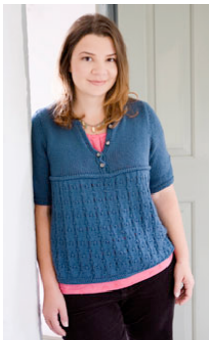
rollover to enlarge