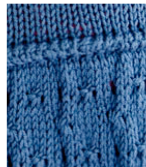
rollover to enlarge